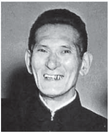
Shumei Okawa (1886-1957)