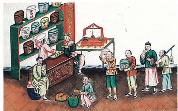
A Sugar Store

Two Chinese Rice Paintings Depicting Sugarmaking, circa 1860 in the collection of the Institute.